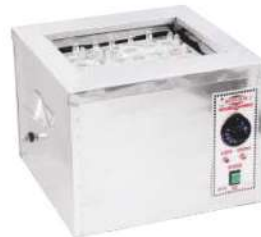
BUTYROMETER WATER BATH (ELECTRICAL)