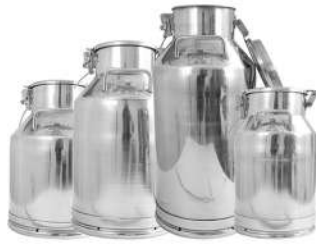
MILK CANS SS