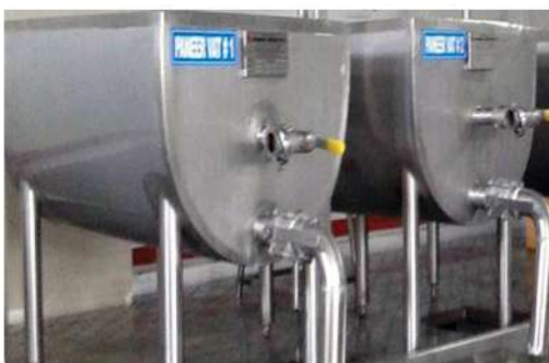
PANEER COAGULATION VAT