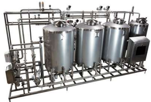
CIP SYSTEM FULLY-AUTOMATIC