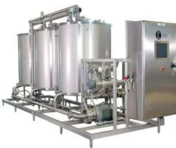
CIP SYSTEM MANUAL