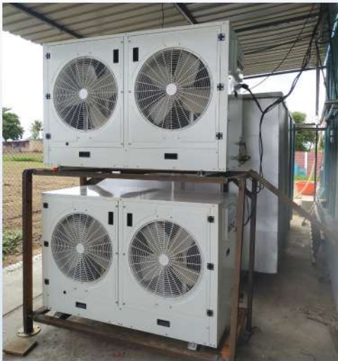
FREEON IBT SYSTEM