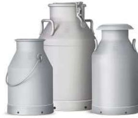
MILK CANS ALLUMINIUM