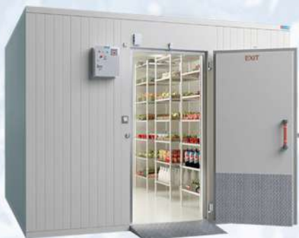
COLD STORAGE ROOM