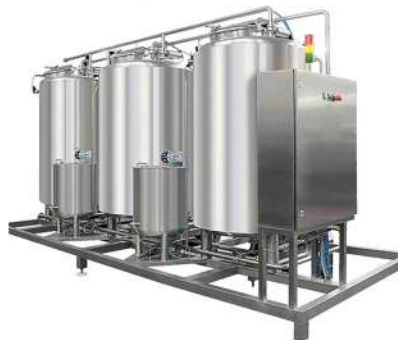
CIP SYSTEM SEMI-AUTOMATIC