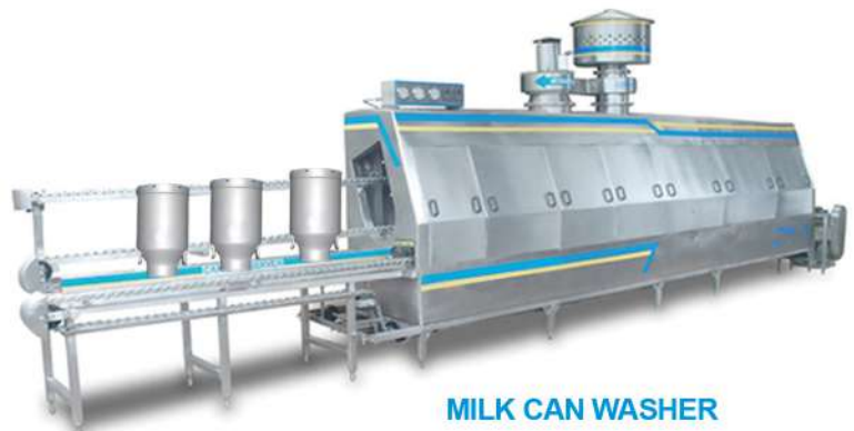
MILK CAN WASHER

DEA introduces the Milk Can Washer—an advanced solution designed to revolutionize the cleaning process of milk cans. In the dairy industry, maintaining a high level of hygiene is not just a priority, it's a necessity. The cleanliness of milk cans directly impacts the quality and safety of the dairy products produced.