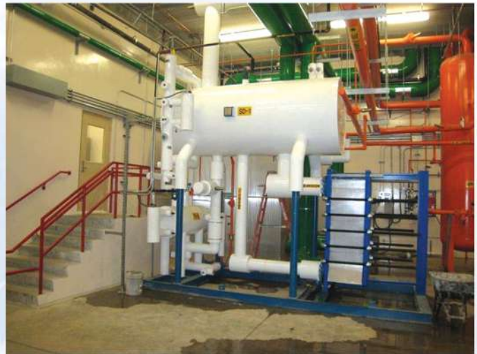
AMMONIA IBT SYSTEM