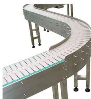
SLAT CHAIN CONVEYOR