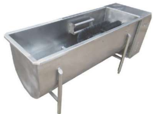
MILK CAN SCRUBBER

We use Jindal Certified SS 304, 316 Grade Raw Material for the best quality