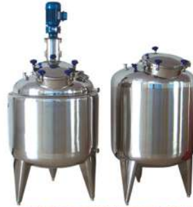
SYRUP MIXING TANKS