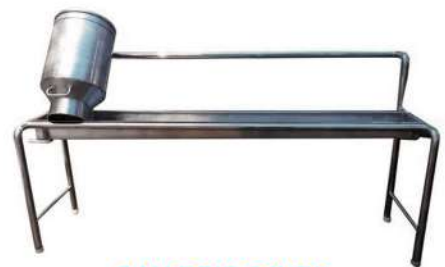
CAN DRIP SAVER