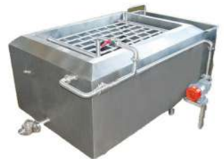
BUTTER MELTING VAT