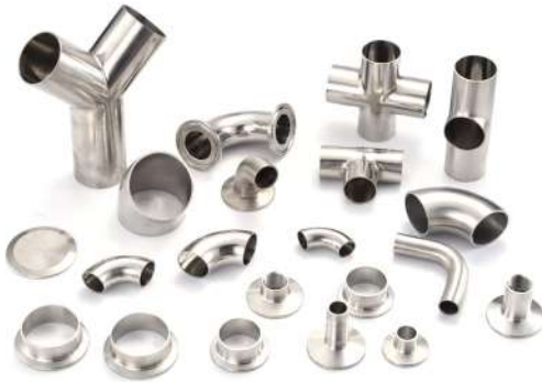
SS PIPE FITTINGS