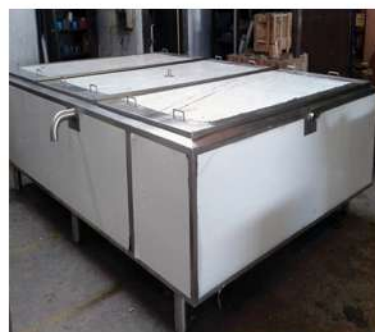
PANEER COOLING TANK