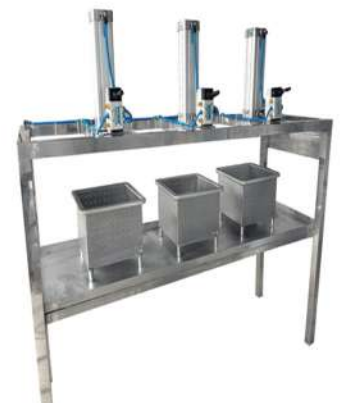
PNEUMATIC PANEER PRESS