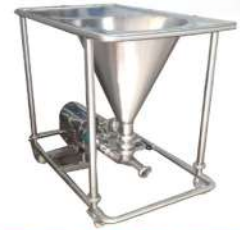
POWDER MIXING VENTURE