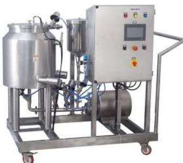
CIP SYSTEM PORTABLE

We use Jindal Certified SS 304, 316 Grade Raw Material for the best quality