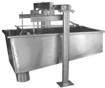
WEIGH SCALE (PLATFORM/HANGING)