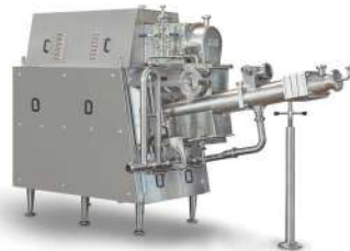
CBM BUTTER MACHINE